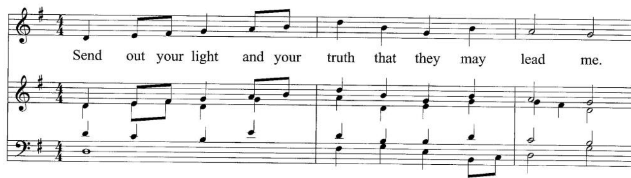
A New Heart and a New Spirit - Ezekiel 36:24-28 Psalm 43: :Please join the choir in singing the refrain

O God, whose wonderful deeds of old shine forth even to our own day, you once delivered by the power of your mighty arm your chosen people from slavery under Pharaoh, to be a sign for us of the salvation of all nations by the water of Baptism: Grant that all peoples of the earth may be numbered among the offspring of Abraham, and rejoice in the inheritance of Israel; through Jesus Christ our Lord. Amen