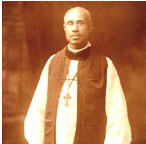
Henry Beard Delany

Henry Beard Delany was the first African-American elected bishop of the Episcopal Church in the United States. The Episcopal Church honors him, along with fellow African American bishop Edward Thomas Demby , who died on the same day in 1957, with a feast day on the liturgical calendar on the anniversary of their deaths, April 14.