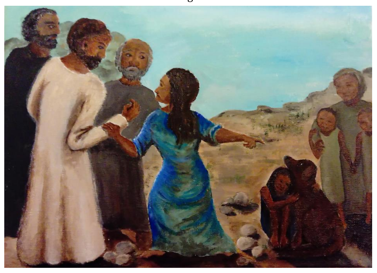
Welcome & Announcements

St. Stephen's Episcopal Church 15 & 16 August 2020