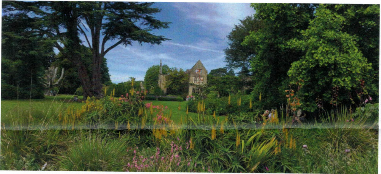
Visiting the coast: