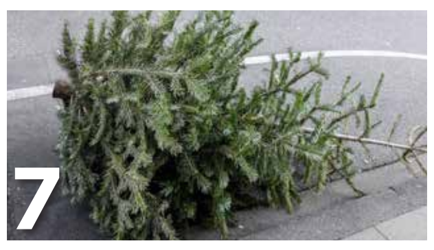
Recycle Christmas Trees for Free Go green this holiday season! Find out how residents can easily and conveniently recycle live

Learn about Port 194 and how the City is working with partners to support innovative, science and technology-based startups in Cochise County.