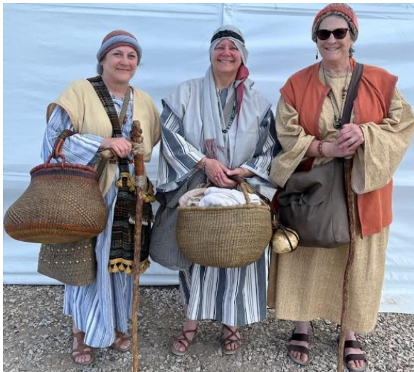
Day one end of day returning props