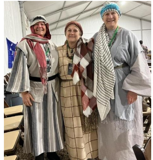
Day two start of day