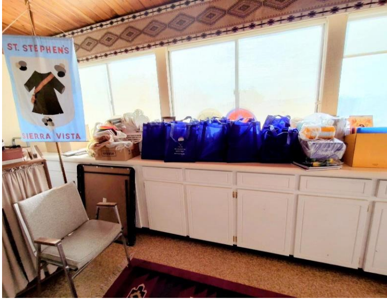
Counter full of donated supplies (above)