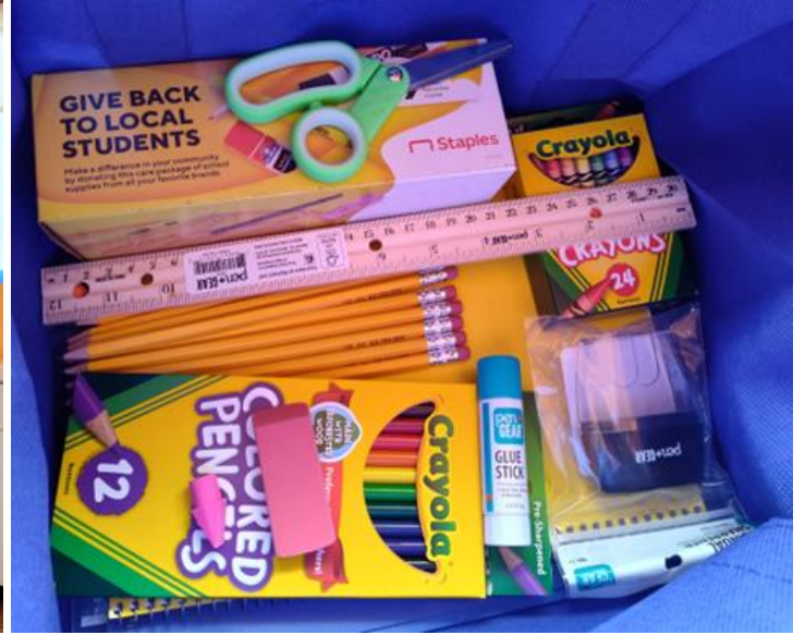
Representative sample of donated items

Thanks to all who contributed to this impressive collection of school supplies for San Simone's schools and start of a new school year! The students and teachers are sure appreciative of our help.