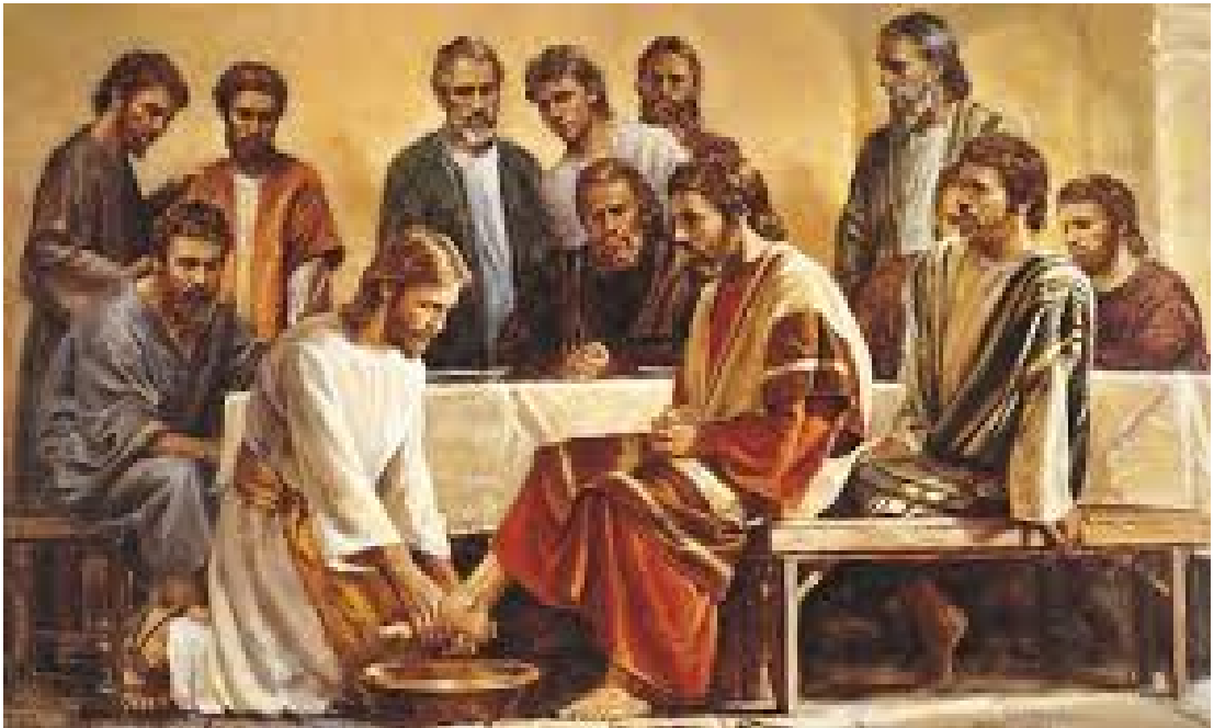
The last supper; the washing of the feet